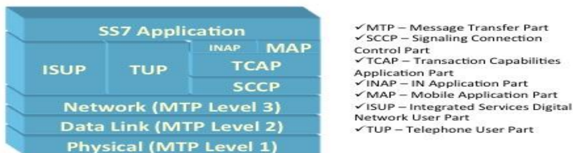
Figure 1: SS7 Protocol Stack over TDM

When cellular networks were first developed, the ability for switches to access databases became a critical function for authenticating subscribers and determining the permissions a subscriber would have in the network. A new protocol was developed for supporting wireless services, called the Mobile Application Part (MAP).