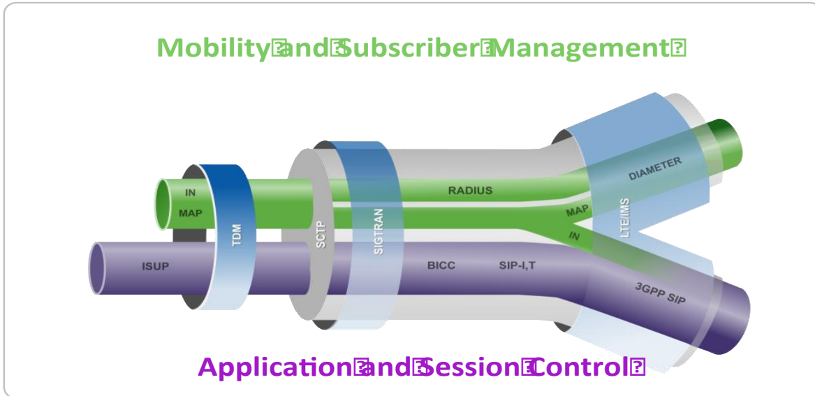
Figure 4: Evolution of Signaling Protocols (Illustration courtesy of Oracle Communications)